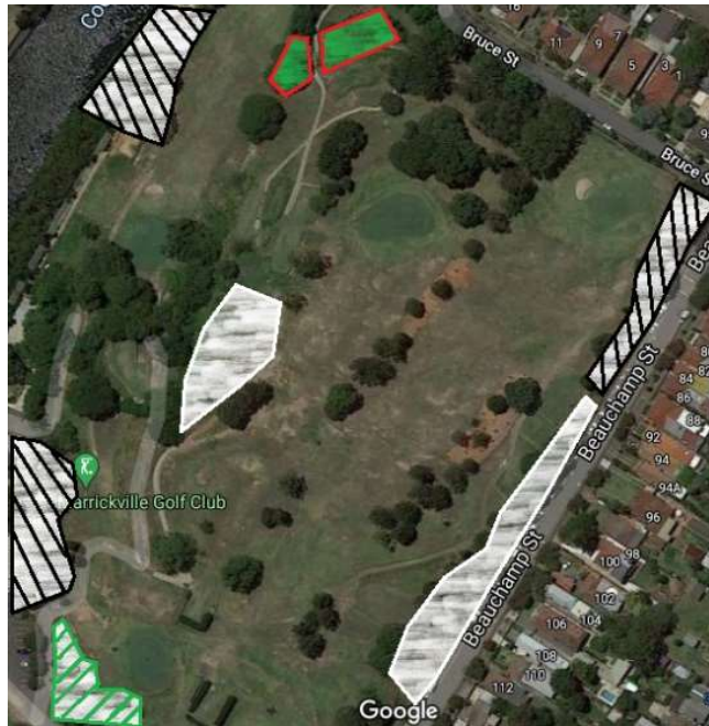
Aerial view of stacked areas.

Please find below a definition of every marker stake you will find on Marrickville Golf Course.